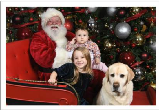
PHOTOS WITH SANTA